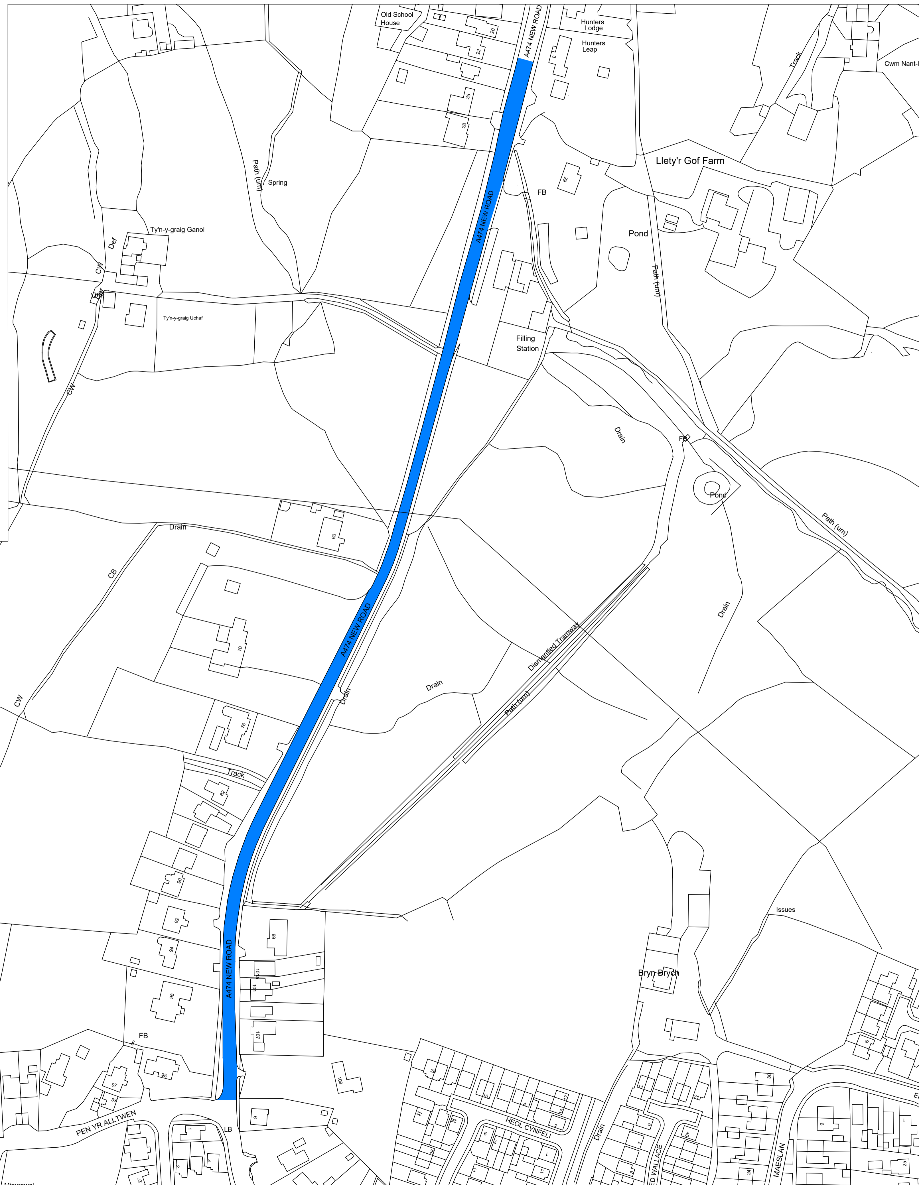
A474 NEW ROAD, GELLINUDD - LAYOUT PLAN SCALE 1:1250