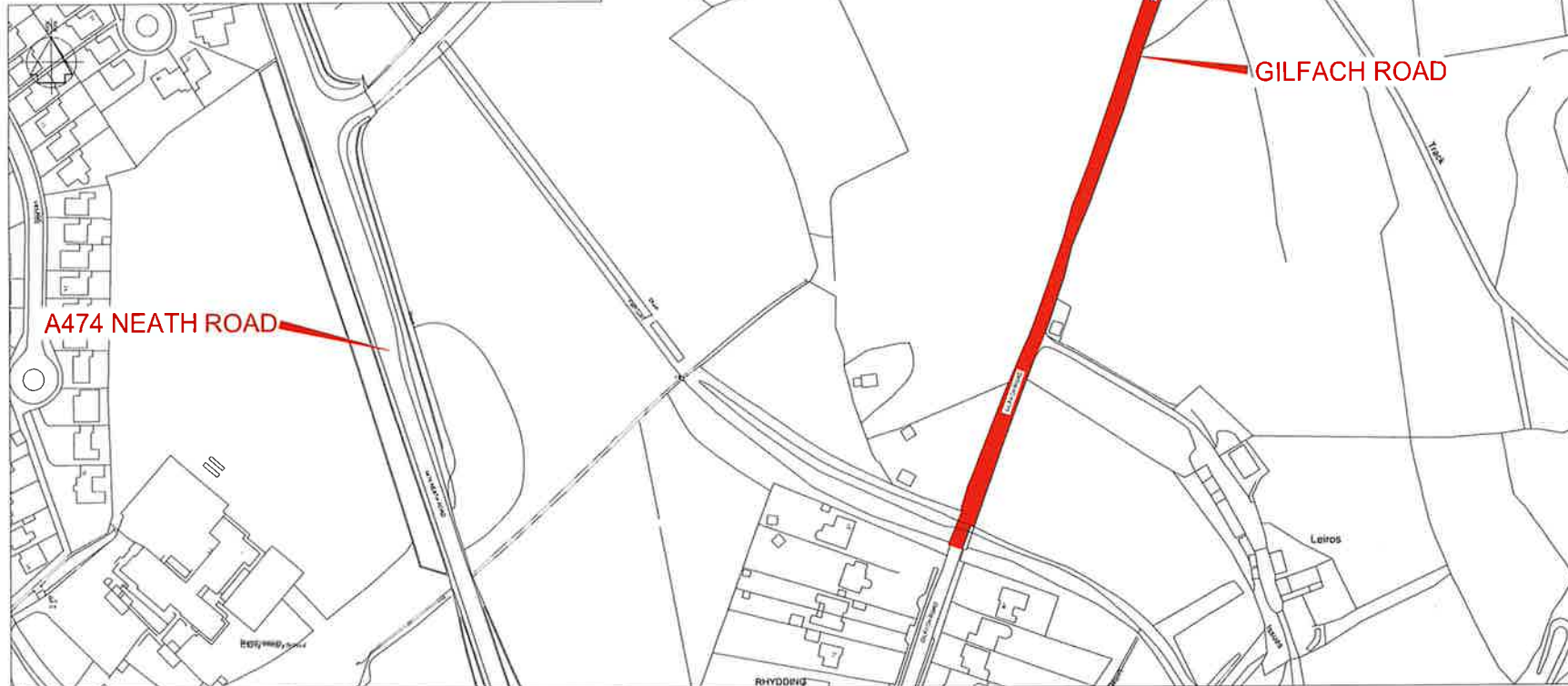
GILFACH ROAD, BRYNCOCH - LAYOUT PLAN SCALE 1:1000