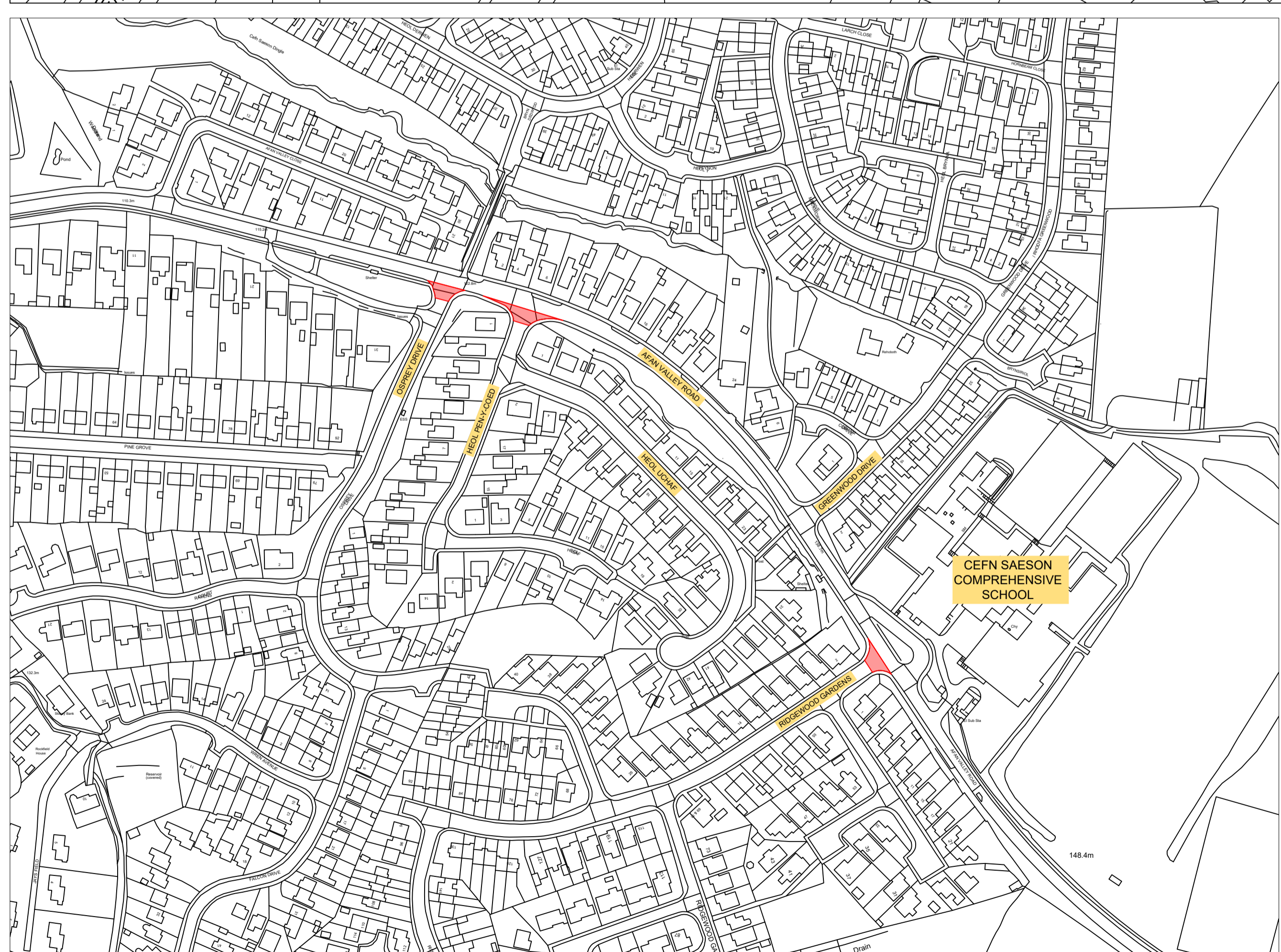
LOCATION PLAN SCALE 1:2000