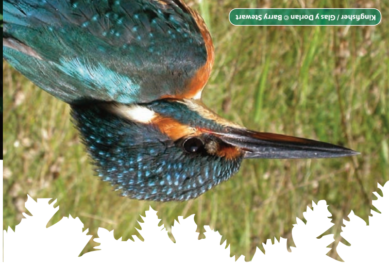
Kingfisher / Glas y Dorian

Gwrandewch am Deloriaid yr Hesyg yn trydar a chan ffrwydroi Telor Cetti (s'n brinach) mewn rhai rhannau o'r gwely cyrs. Mae sawl math o bill-pala a gwas y neidr i'w gweld hefyd yn ystod yr haf.