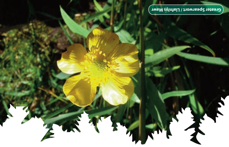
Greater Spearwort / Llafnlys Mawr

Glas y Dorian – Cadwch eich llygaid allan am ffach lachar las yn gwibio heibio wrth i chi gerdded ar hyd y gamlas. Gellir gweld Glas y Dorian yn hedfan ac, os ydych yn lwcus, yn clwydo ar hyd y gamlas trwy gydol y flwyddyn. Mae'n amhosib camgyrryd yr adar hyn oherwydd eu plu glas ac oren llachar.