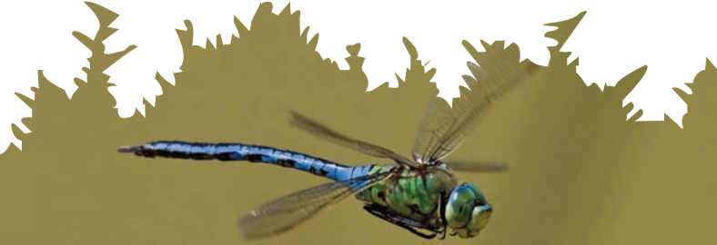
Emperor Dragonfly / Ymerawdwr

Am fwy o wybodaeth am gael mynediad i ardaloedd gwledig ac am hawliau tramwy, ewch i dudalennau cefn gwlad ein gwefan www.npt.gov.uk/countrysideaccess neu ffoniwch 01639 686868 . Am fwy o wybodaeth am fywyd gwyllt yng Nghastell-nedd Port Talbot, ewch i www.npt.gov.uk/biodiversity neu ffoniwch 01639 686149 . I gael manylion am leoedd eraill i ymweld â hwy yng Nghastell-nedd Port Talbot, ewch i www.visitnpt.co.uk